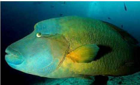
Napoleon Wrasse ( Cheilinus Undulatus )

Diving in the waters around Vamizi, you are likely to encounter any number of endangered species; Bumphead Parrotfish, Napoleon Wrasses, Potato Groupers and several types of shark. In order to gather