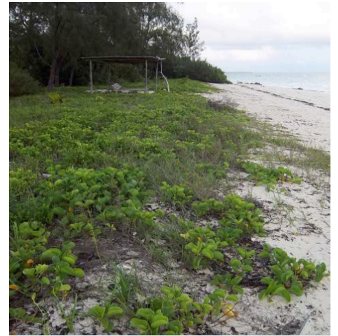
GOOD: A stable and well vegetated primary dune in front of a lodge villa. This is a mixture of ground-creeping species and grasses.