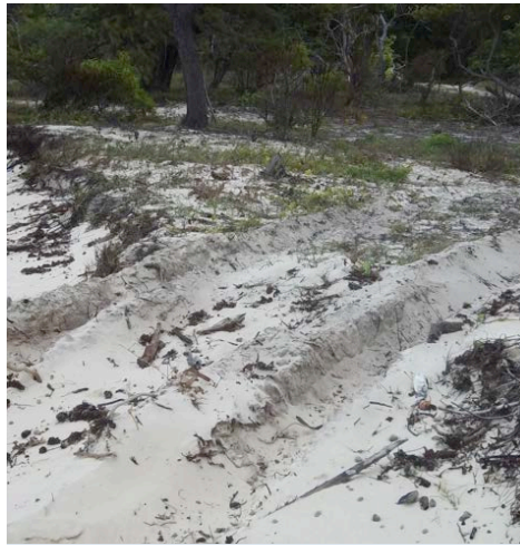
BAD: Low density vegetation requiring WWF intervention.

Climate change is a reality and along with it exists the threat of rising sea levels. The WWF are taking action now to protect and maintain a healthy primary dune system. A well vegetated primary dune serves a number of important functions. Firstly, a dense covering of vegetation that includes ground-creeping species such as Ipomoea, helps 'bind' the sand. Secondly, grasses and low shrubs provide a habitat for a range of animal species. The result is a stable dune that acts as a physical barrier to the rising sea, especially on a spring tide. WWF is actively planting a combination of plant species on any denuded primary dunes as well as removing some Casuarina trees whose acidic pine needles inhibit the growth of other vegetation. ■